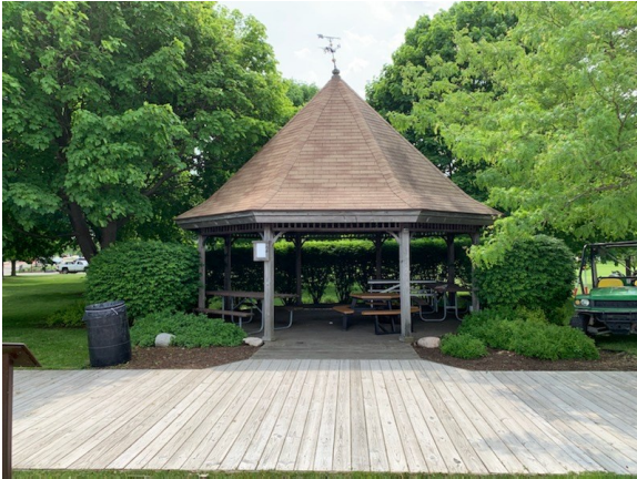
Gazebo 2—Off of boardwalk