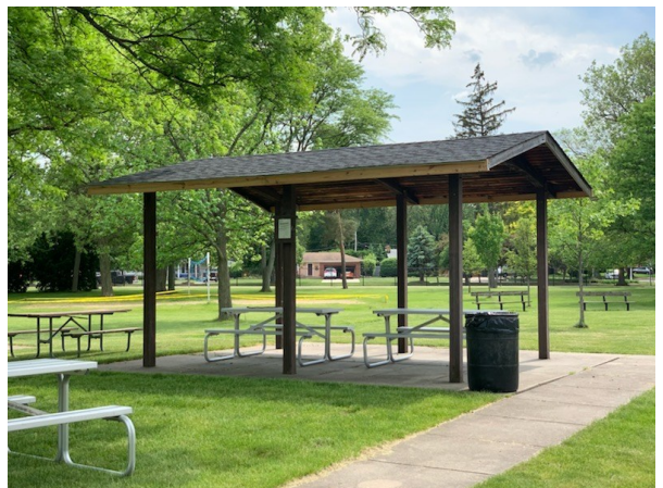
Pavilion 2—Near volleyball court