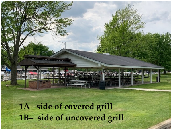
Pavilion 1—Near marina