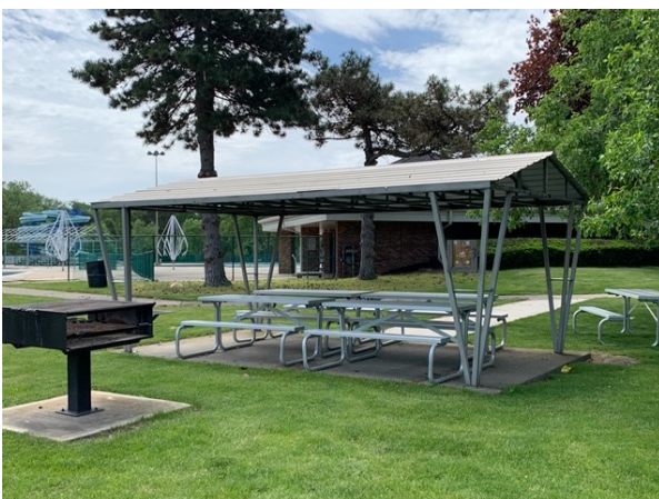
Pavilion 3—Near bathhouse