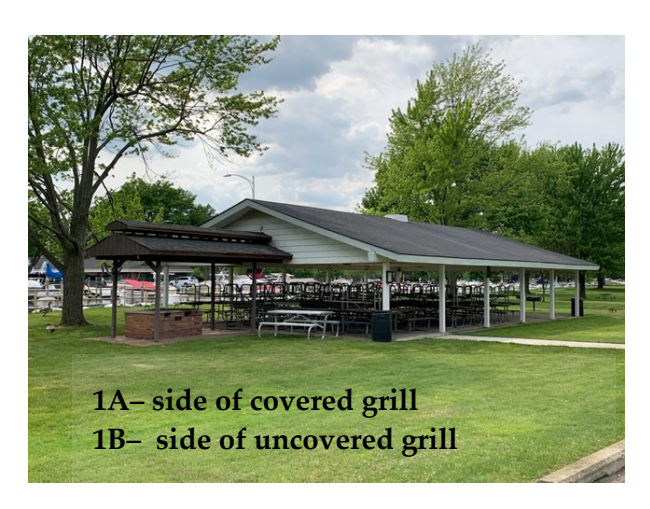
Pavilion 1—Near marina