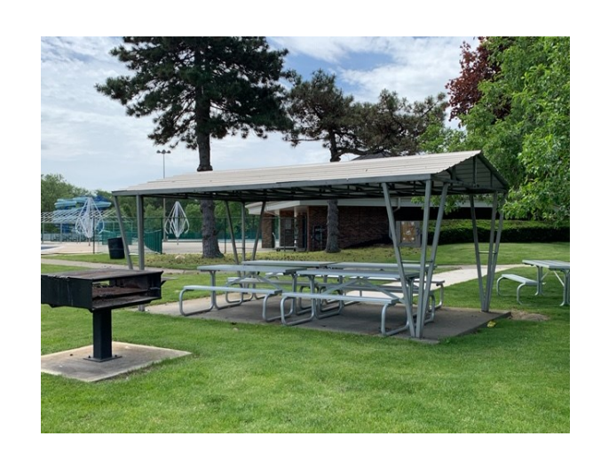
Pavilion 3—Near bathhouse