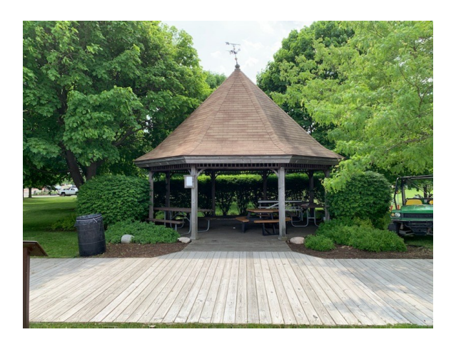
Gazebo 2—Off of boardwalk