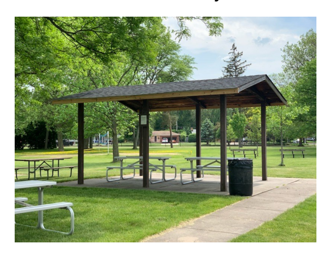
Pavilion 2—Near volleyball court