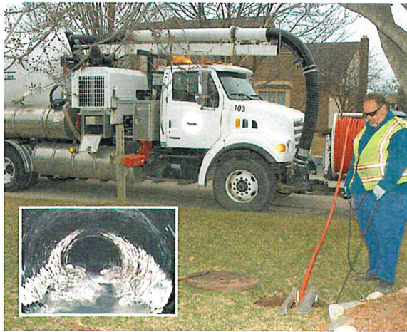
FOG build-up in sewer pipes (inset photo) requires local public works staff to go to the site and remove the blockage. The extra maintenance required to clean the sewer comes at a cost to all sewer system users.

Wastewater collected from our community is transported to the Great Lakes Water Authority's (GLWA) Water Resource Recovery Facility (WRRF) in Detroit that treats sewage from 77 communities.